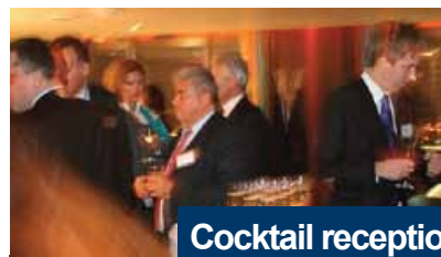
Cocktail reception host